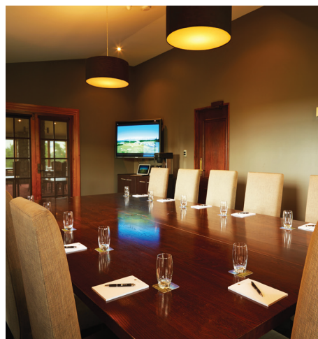
HIGH PEAK ROOM